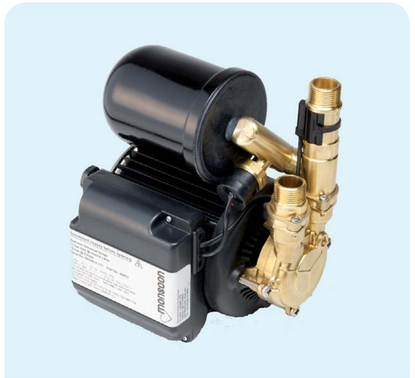
Monsoon Universal Single Pumps